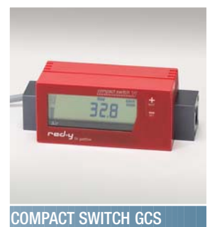
COMPACT SWITCH GCS

A threshold value can be activated for leak detection. The totalling unit permits use as a gas meter.